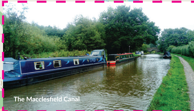
The Macclesfield Canal